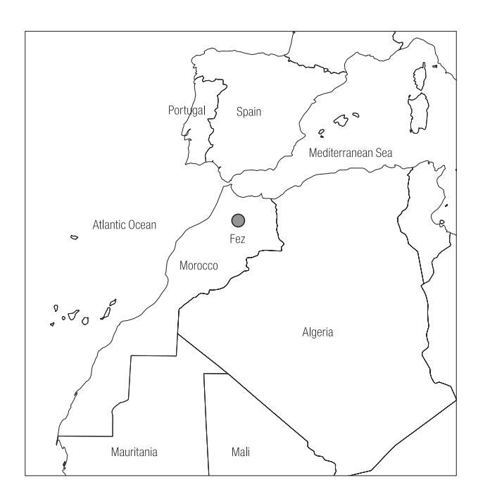
Fig. 1. City of Fez in the north of Morocco

The general population is exposed to Pb mainly from petrol, active or passive smoking, industrial emissions, paint and ceramics [9,10]. Cigarettes smoke is the main source of exposure to cadmium, although there are other such as contaminated water, foods enriched with this metal like shellfish, dairy products and meat (especially liver and kidneys), foods improperly stored in containers, which contain cadmium, and the inhalation of polluted air from foundries or incinerations [11]. Environmental exposure to mercury (Hg) comes mainly from fish intake and dental amalgam fillings [4].